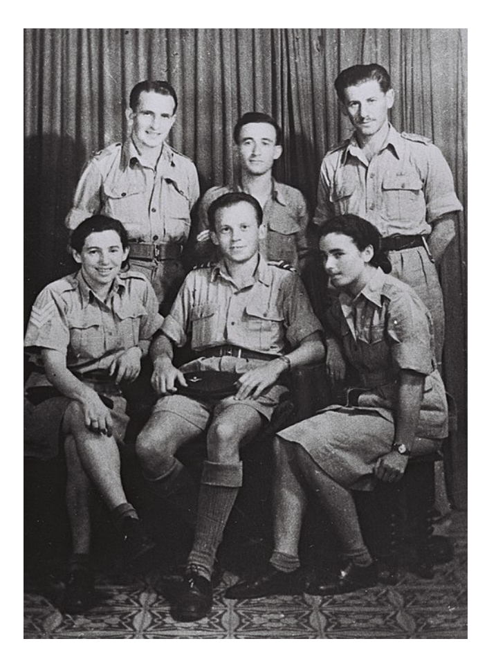
Page 3 of 7