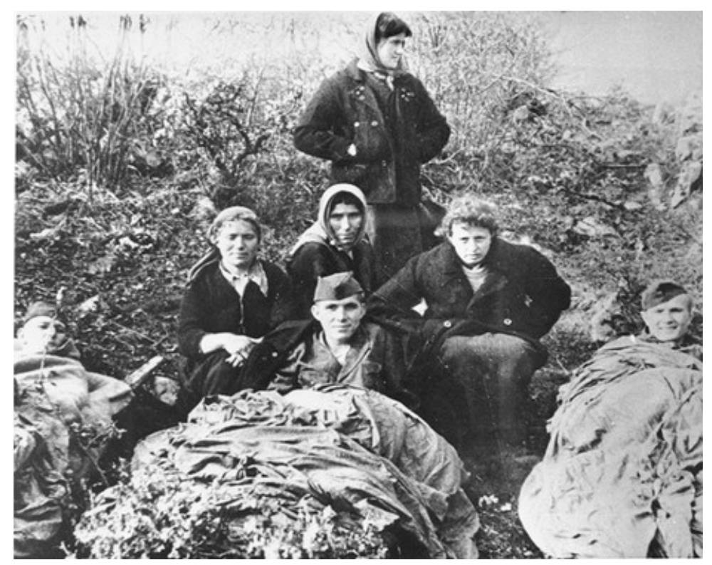
1944 Yugoslav partisans with Jewish parachutists from Palestine