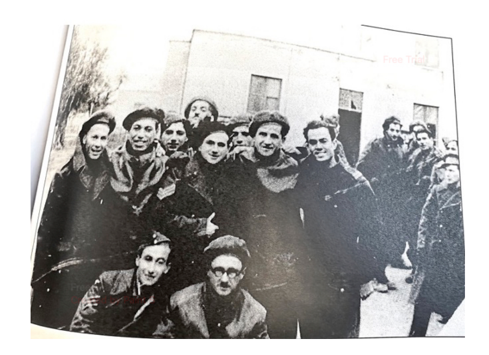
Romanian-born Palestine Jews before departure to be parachuted into Romania