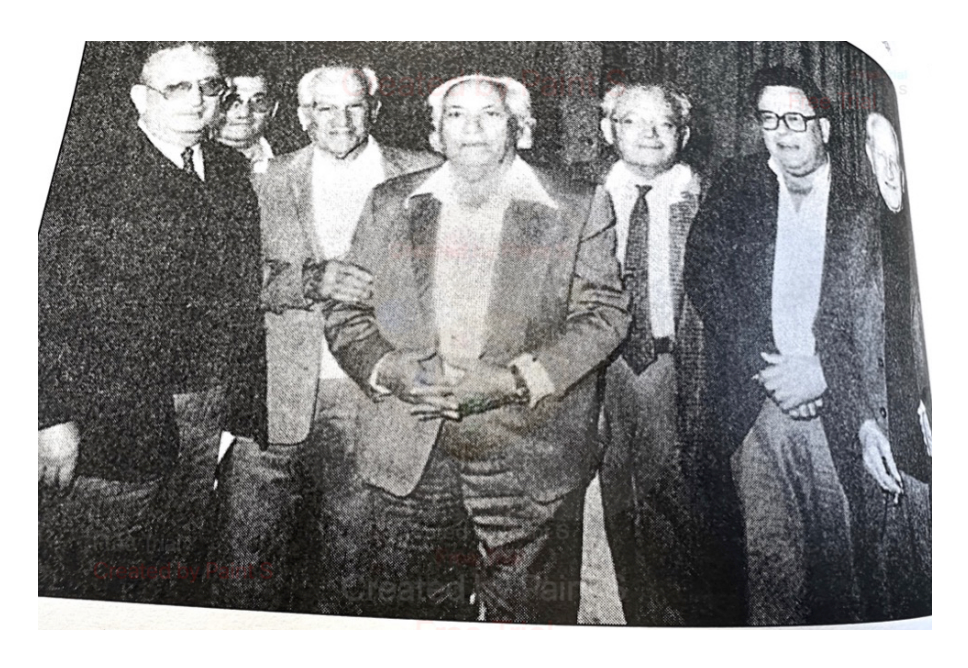
Romanian-born Palestine Jews who were parachuted into Romania at a Tel-Aviv reunion