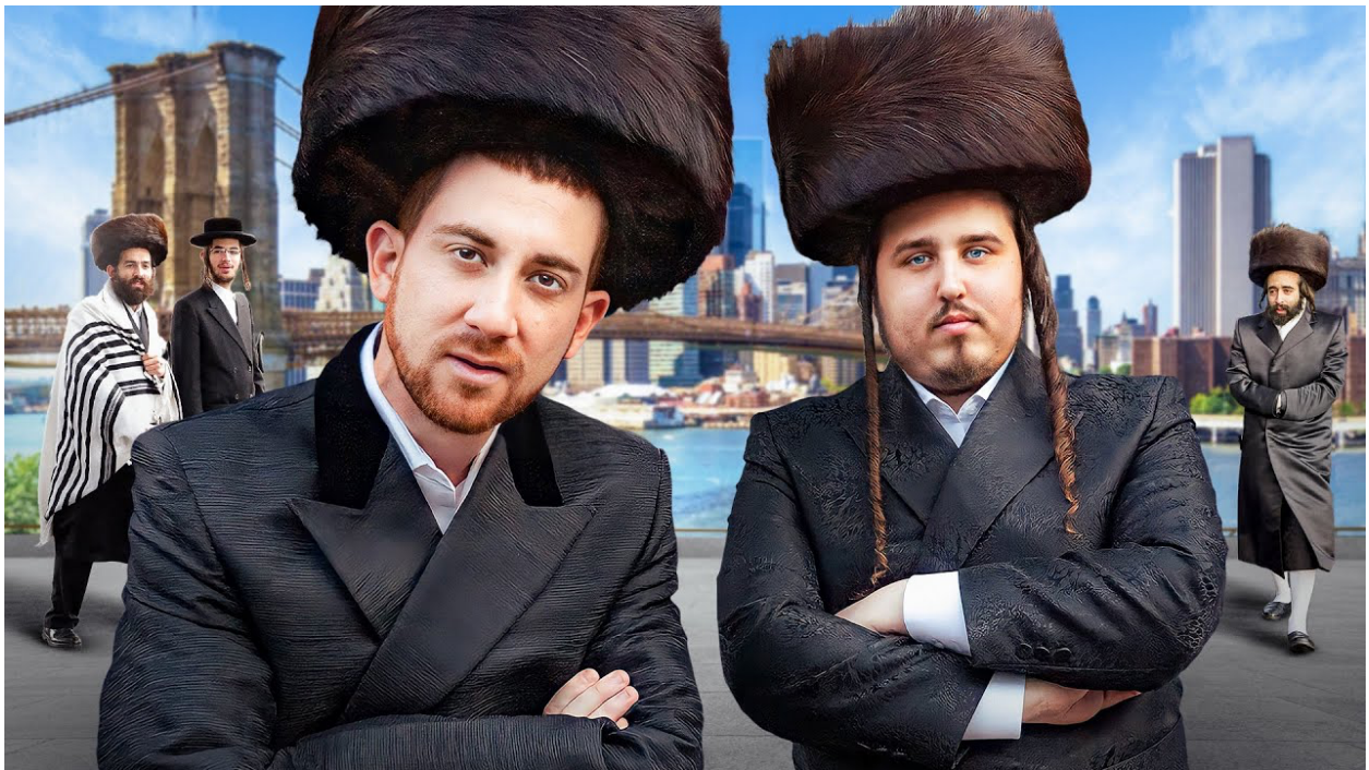
Hasidim in New York