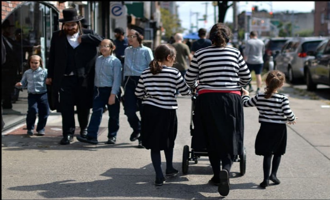
Satmar families on Lee Avenue in Williamsburg, Brooklyn, in September 2020.