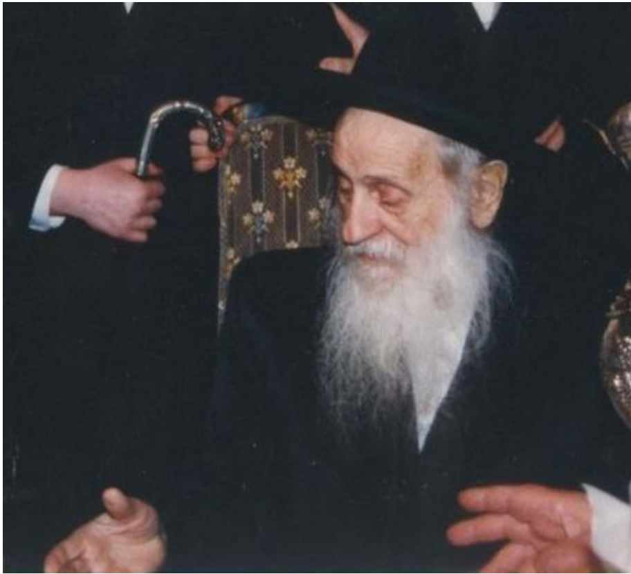
Rebbe Moshe Teitelbaum