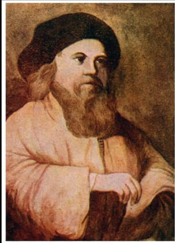
Rabbi Israel ben Eliezer, also known as the Baal Shem Tov.

These are the Notes for episode 15 – “Hasidic Judaism”, of the “History of the Romanian Jews” podcast.